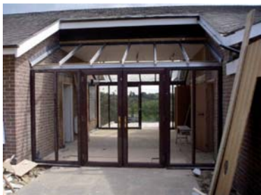
Front of bungalow now; new glass doors have been installed to create an atrium and visitor information area