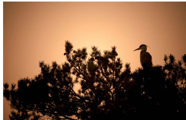
Next spring you will be able to watch herons in the sunset.