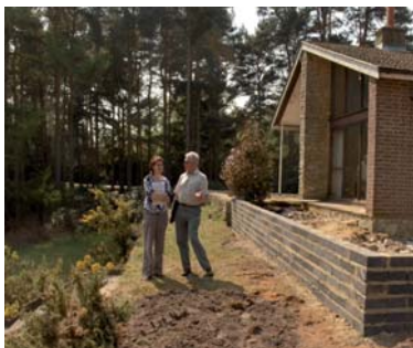
The outside of the bungalow now benefits from a decking area from which you can observe the heronry.

We would like to say a huge thank you to everyone who made this possible including our funders who helped with the purchase of Rushmere and our partners, contractors and volunteers who have worked very hard to get Rushmere ready to open.