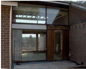
The front of the bungalow during building works

Toilet facilities and a visitor information area have been put into the 1960's bungalow which was originally part of the private estate.