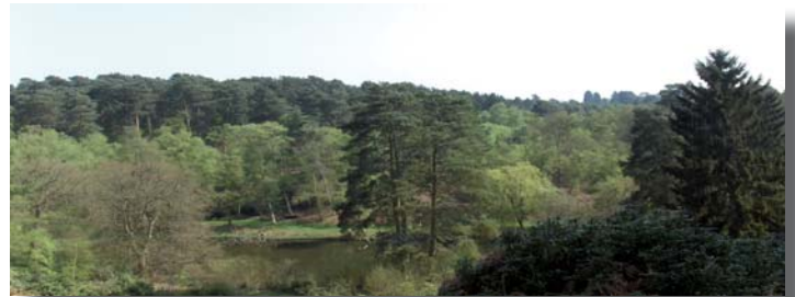
To the rear of the visitor centre the slope and valley will be left as a conservation area.