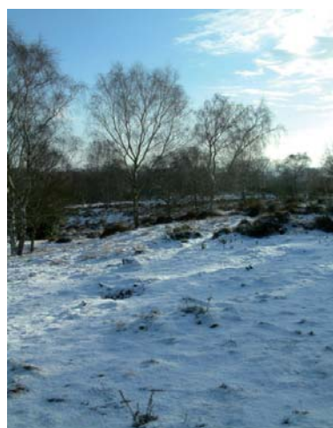
Cooper's Hill in the snow

The purpose of the photographic competition was to raise awareness of the Countdown 2010 Heathlands of the Greensand Ridge project, encourage people to visit their local heathland sites and to produce images that could be used by the Trust to promote the project.