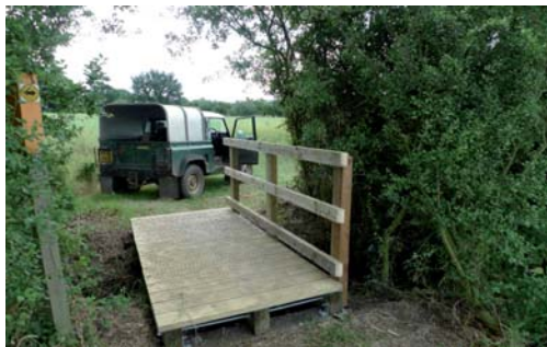
The completed bridge!