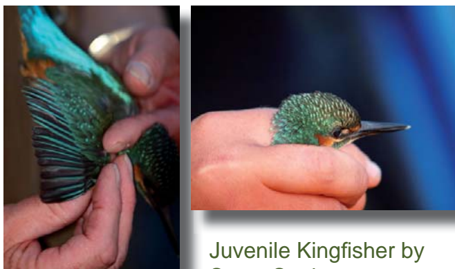
Juvenile Kingfisher

The second bird ringing event in the reserve recorded a young Kingfisher in July. Bird ringing is carried out by experienced specialists so the bird is not harmed when the small, lightweight ring is fitted onto the birds leg.