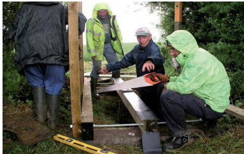
Volunteers constructing the bridge

Despite the wet weather, volunteers worked with Greensand Trust rangers to replace an old railway sleeper bridge across a ditch near Thrift Wood.