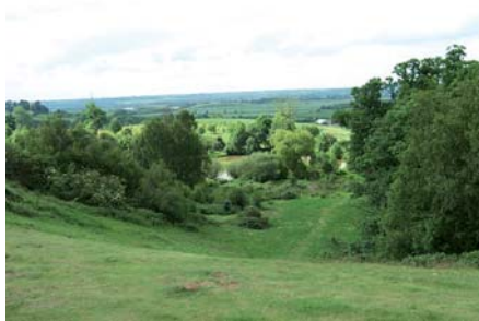
Ampthill Park, view over the resevoir