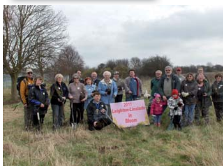
The Greensand Trust is helping the Leighton Linlade in Bloom campaign and kicked it all off with an open tree planting session. It was a really enjoyable morning and we were lucky with the weather and had a great turn out of volunteers.