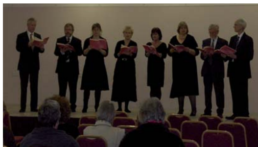
Local singing group Octad performed at the charity auction

Leighton Linlade Town Council have agreed to give £20,000 to the Greensand Trust to provide public access to the site after its purchase.